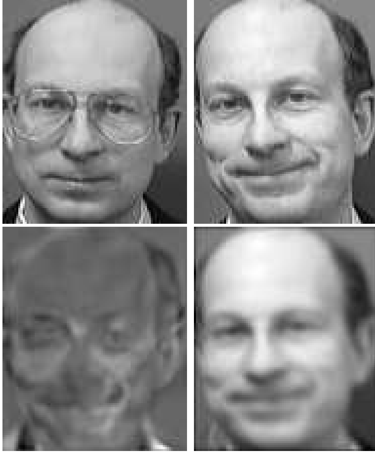
FIGURE 2. From up to down and from left to right: initial image, target image, z -coordinate, reconstructed target image

of \bar{p}(\gamma_t) is a consequence of the pointwise convergence of \bar{p}^{N,N}(\gamma_t) to \bar{p}(\gamma_t) , which comes from the following argument: for all N and \lambda , we have |\bar{p}^{N,\lambda}(\gamma)|_W \leq |\bar{p}(\gamma)|_W , since the last term in (32) vanishes for w = \bar{p}(\gamma) . For the same reason,