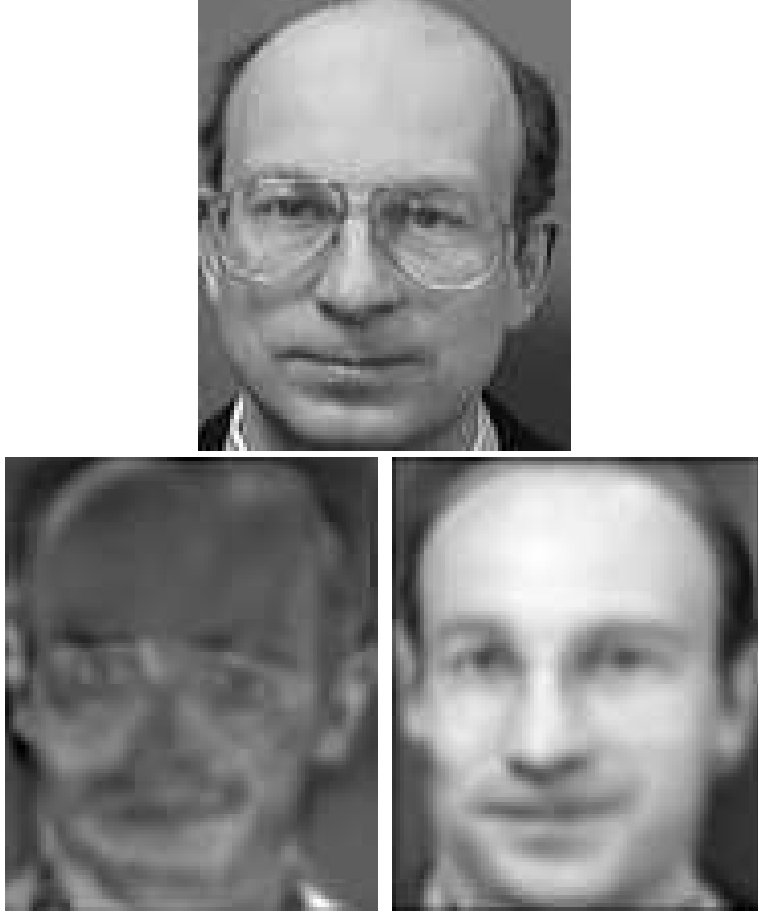
FIGURE 4. From up to down and from left to right: initial image, target image, z -coordinate, obtained by averaging the z -coordinate in figures 2 and 3, and obtained target image

Lemma 6. Let w = (z, v) \in L^2([0, 1], W) . Let us define for any t \in [0, 1] :