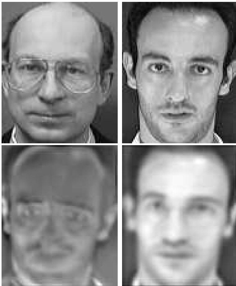
FIGURE 3. From up to down and from left to right: initial image, target image, z -coordinate, reconstructed target image

Then almost everywhere in t , w_t \in E_{j_t} .